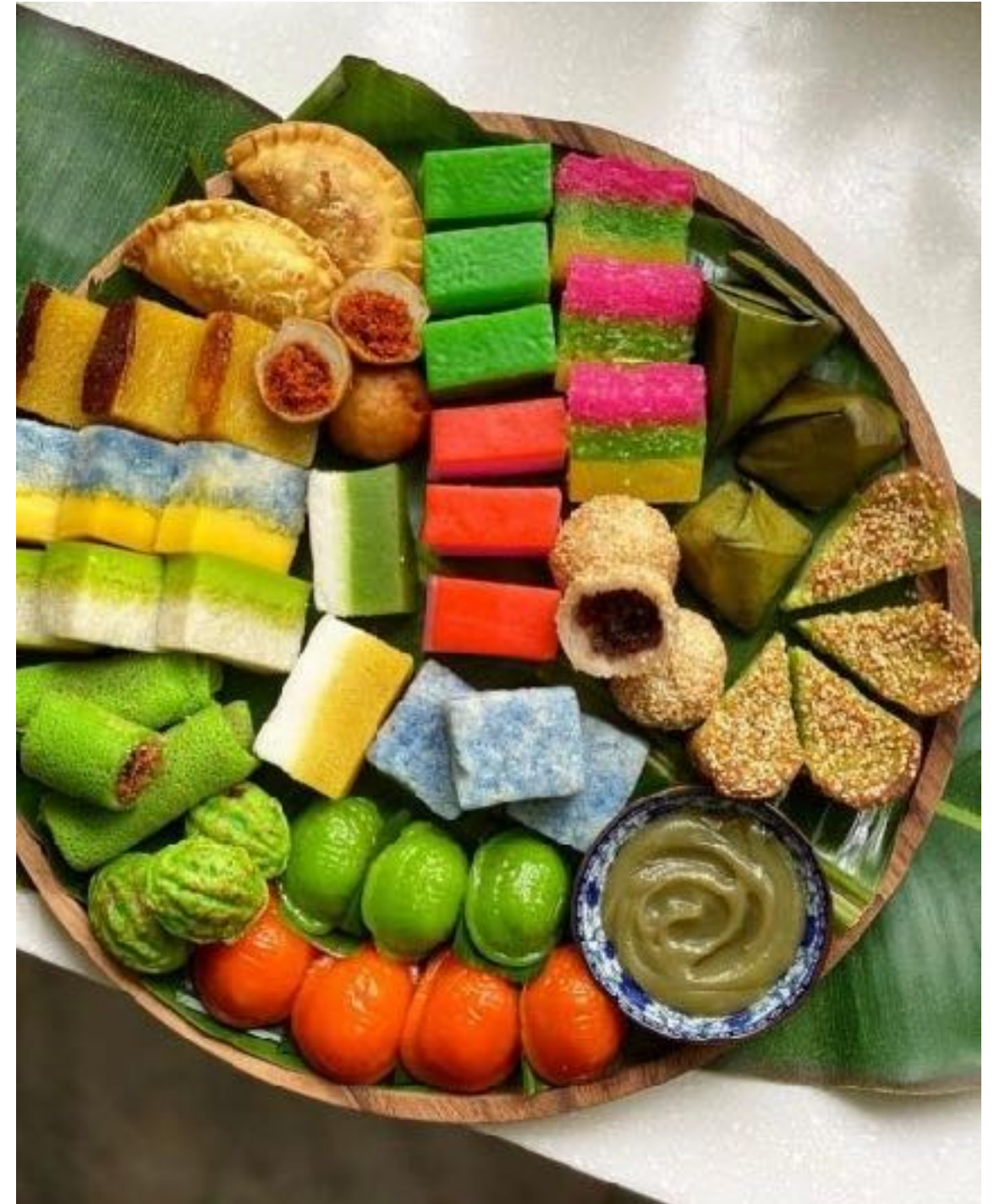
Kuih-muih (in Malay) are bite-sized snack or dessert foods commonly found in Penang

Visitors to the city will find Penang's history not only in its buildings and monuments but also in the community and everyday life of the city which is a rich mix of modernity and turbulent history.